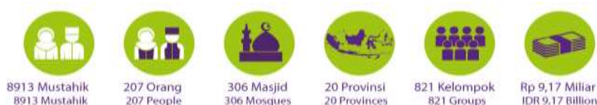
Figure 2 KUM3 Program Overview (2013)

Based on the data above showing that since beginning to operate, counted from 2006 to _ in 2013 KUM3 has assisted 831 groups effort micro with a total mustahiq reached 8,913 people with a total budget of IDR 9.17 billion. They spread across 20 provinces and succeeded develop effort them.” The KUM3 program is a program that mosque -a based form from a mosque congregation. this is delivered through a results interview, with Sir Taufiq is one Staff at Bank Muamalat sharing the program light sacrifice that: “...the KUM3 program is a flagship program based on a mosque, why mosque -based, that is because LAZ BMM thinks that election communities effort based micro through relative mosque congregation more blessing because definitely the managers no only focus yourself in business just but they will always remember Allah, so level blessing that the more many and then that is what Religion expects .”