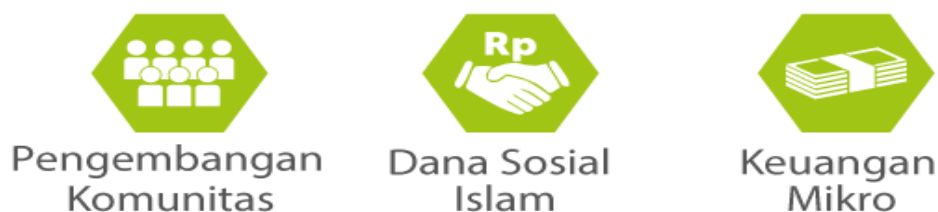
Figure 4 Management of Zakat