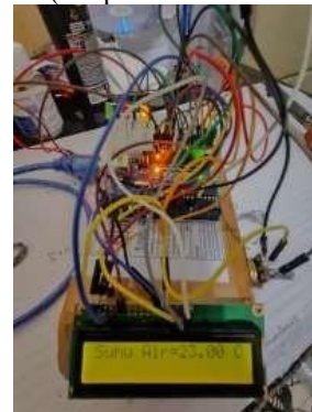
Figure 10. Temperature water less than 27°C

And led light up colored yellow signifies water in circumstances cold (temperature water less than 27°C).