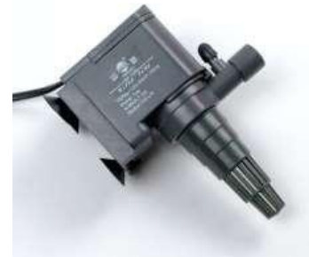
Figure 3. Pump Water Aquarium

shrimp vaname. Pump water will arrange by microcontroller for pump water Which different temperature into the aquarium to temperature fixed water constant [10].