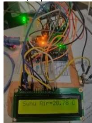
Figure 9. Temperature water 28°C - 30°C

LEDs light up colored green signify water in circumstances normal (temperature water 28°C - 30°C)