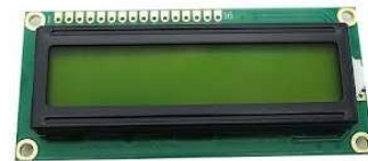
Figure 4. LCD (Liquid Cristal Displays) 16x2

Displays electronic is Wrong One component electronics which functionas a data display, good character, letters or graphics. LCD (Liquid Cristal Displays) is Wrong One type displays electronic Which made with technology cmos (Complementary Metal- Oxide - Semiconductor) logic it works with No produce light but reflect light Which There is in around him to front- lit ortransmit data Good in form character, letter, number, or graphics.