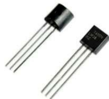
Figure 2. Sensors LM35 temperature

Sensors temperature LM35 is sensors temperature analog which can measure temperature with accuracy until 0.5 degrees Celsius. Sensors this operates in a temperature range of -55°C until 150°C and own sensitivity output as big 10mV per degree Celsius.