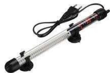
Figure 5. Heating Water (Heater)

On stage This planning system function as description general about How water temperature