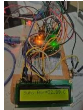
Figure 8. Temperature water more from 31°C

signify water in reservoir in circumstances hot (temperature water more from 31°C),