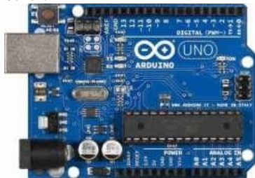
Figure 1. Arduino Uno R3

arduino Uno is microcontroller open-sources Which designed for make it easy users in creating electronic projects. arduino Uno use Language C/C++ programming and can relate to a wide variety of sensors and devices electronic other.